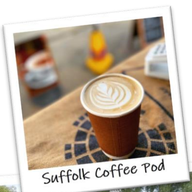
Suffolk Coffee Pod

Help is available in Woodbridge and Melton for anyone struggling to afford food for themselves and their family.