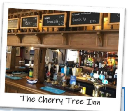
The Cherry Tree Inn