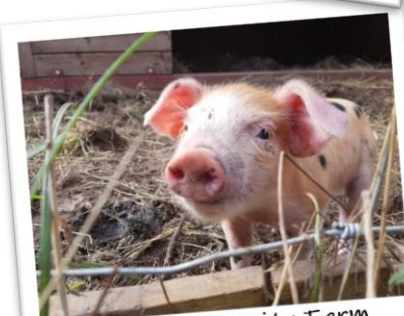
Melton Community Farm

If you have any comments, suggestions or questions about the Local Food Project, you can email us at localfoodip12@gmail.com .