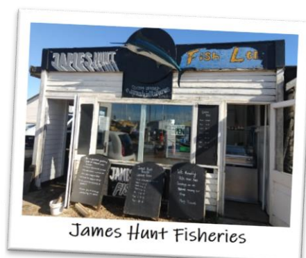
James Hunt Fisheries