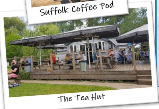
The Tea Hut

There are also two Little Free Pantries in the local area where you can 'Give what you can, take what you need'. One is in the foyer of St Andrew's Church Hall, Station Rd, Melton, IP12 1PX which is open 10am - 5pm Monday to Wednesday. The second is located alongside St John's Church Hall, St John's Road, Woodbridge, IP12 1ED and is always open.