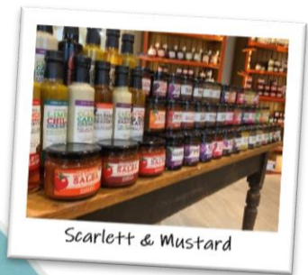
Scarlett & Mustard