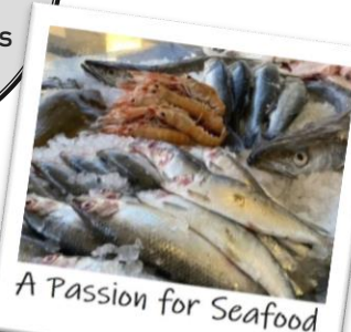
A Passion for Seafood