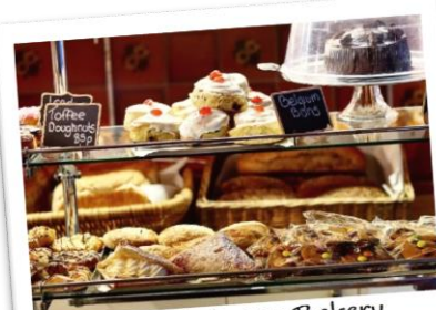
The Bakehouse Bakery

Local food needs less protective packaging and so generates less rubbish